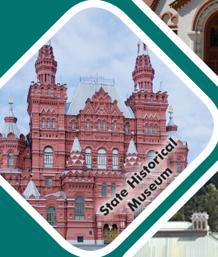
State Historical Museum