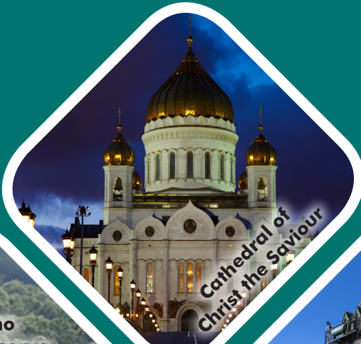
Cathedral of Christ the Saviour