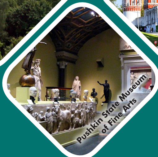
Pushkin State Museum of Fine Arts