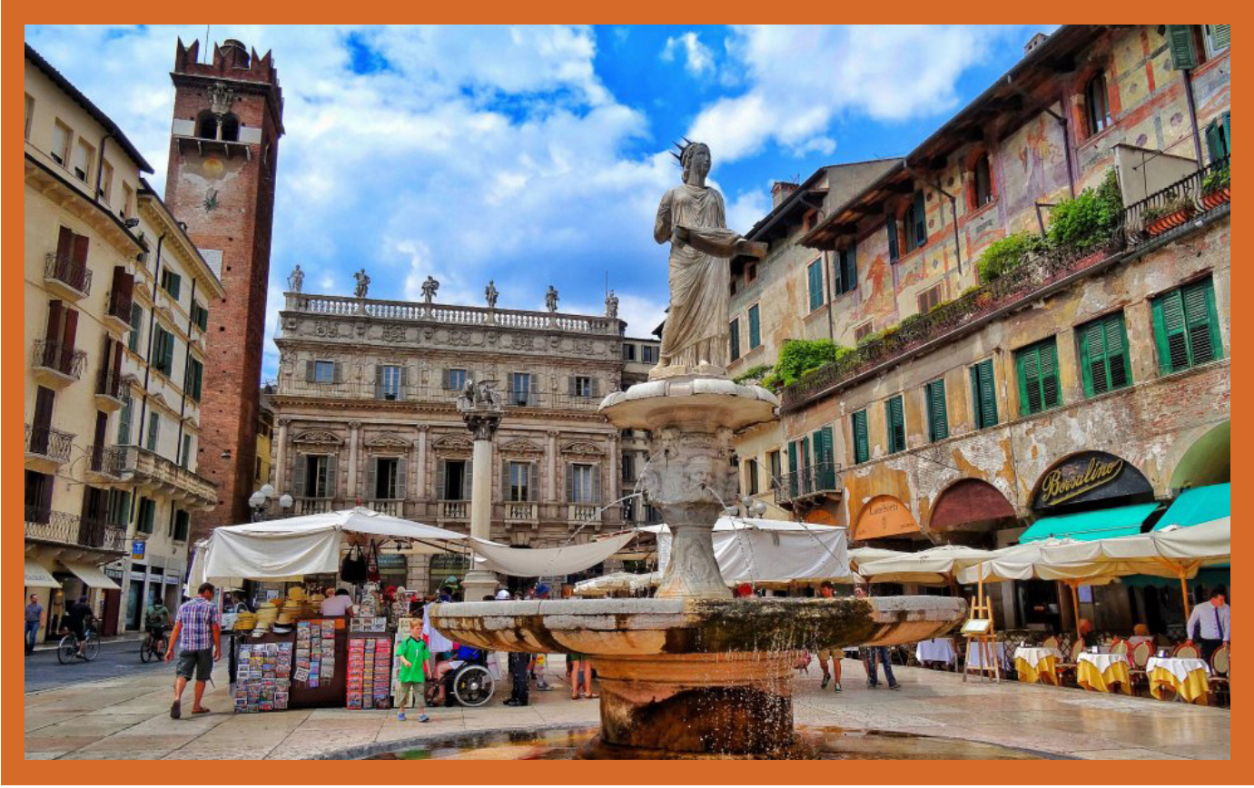
Delee Erbe Square