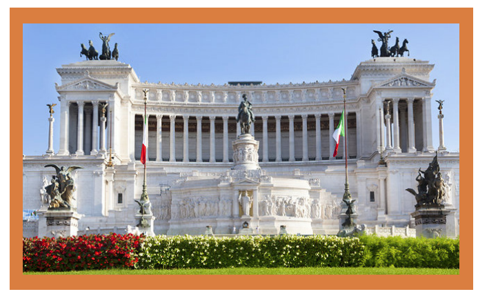
National monument to Victor Emmanuel