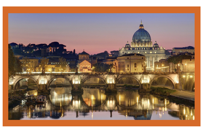
st peters basilica