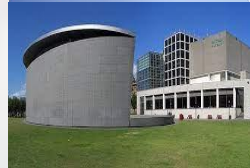
Van Gogh Museum