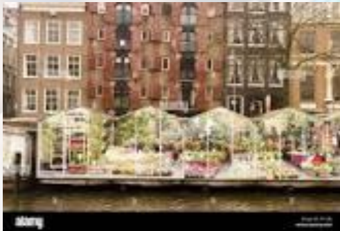
Floating Flower Market