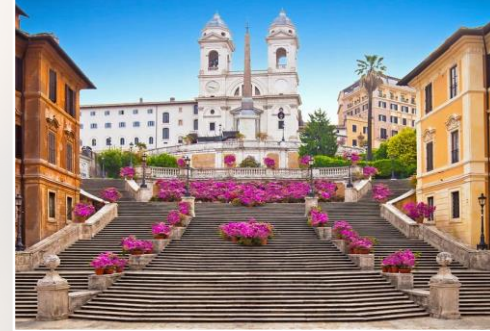
Centro Storico & the Spanish Steps