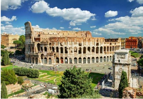
The Colosseum and the Arch of Constantine