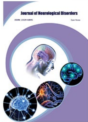
Journal of Neurological Disorders