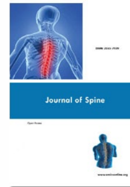
Journal of Spine