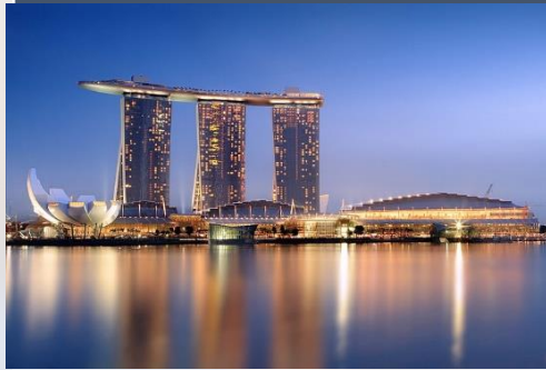
Marina Bay Sands