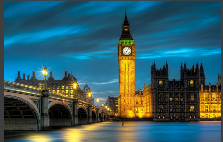
Site: London, UK

London is the capital and largest city in England and the United Kingdom, and the largest city in the European Union. London is considered to be one of the world's most important global cities and has been termed the world's most powerful, most desirable, most influential, most visited, most expensive, innovative, sustainable, most investment friendly, most popular for work, and the most vegetarian-friendly city in the world. London has always been a commercial city and today enjoys the status of having one of the largest city economies in the world. The city thrives in trade and commerce and has a vibrant culture seeped in commerce. It has a GDP of over £565 billion, which is about 17 percent of the UK's total GDP. The size of its economy is larger than that of several European nations. The Port of London handles 48 million tons of cargo every year. The service sector employs 3.2 million people in London, which is about 85 percent of all jobs available in London's service industries. Out of this, the financial sector alone employs about 1.25 million people, or about one in every three jobs available. The manufacturing and construction industry, in contrast, employ half a million residents of Greater London, which is about 11 percent of the employable population of Greater London.