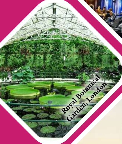
Royal Botanical Garden, London