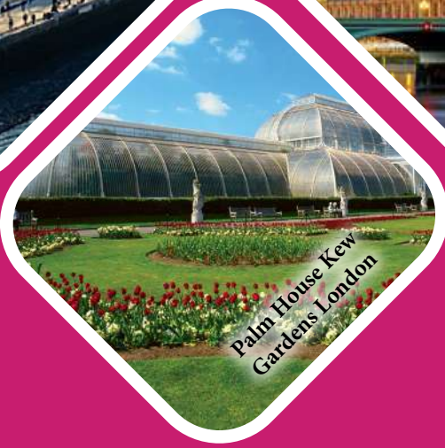
Palm House Kew Gardens London