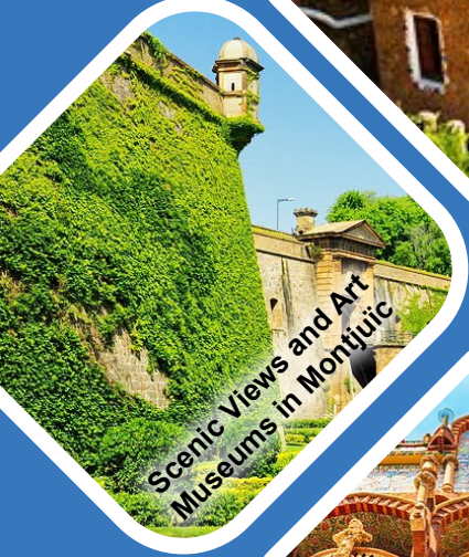
Scenic Views and Art Museums in Montjuïc