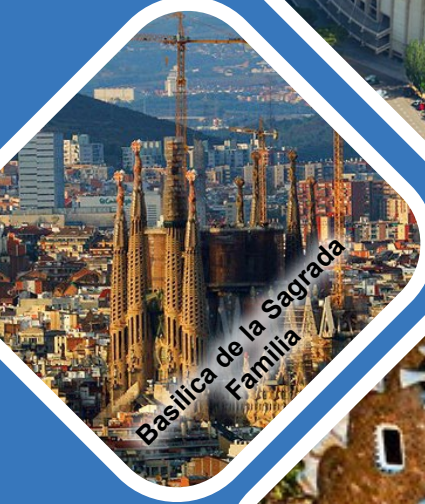
Basilica de la Sagrada Família