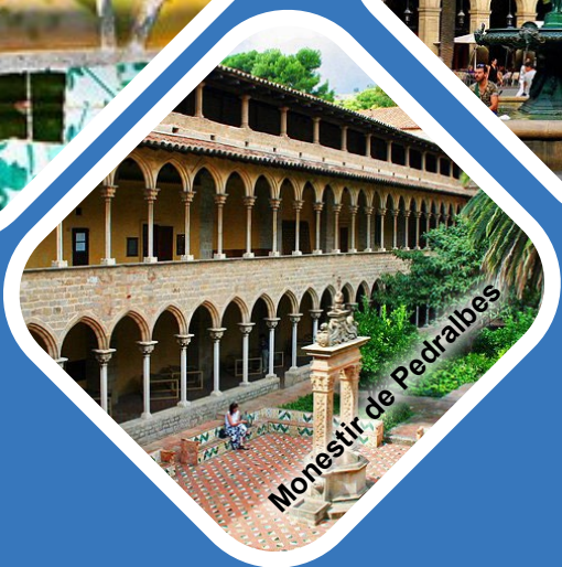
Monestir de Pedralbes