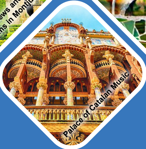
Palace of Catalan Music