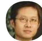
Xiang chun Wang NIAID/NIH USA