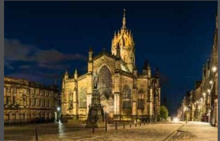
Site: Edinburgh, Scotland

Edinburgh is the capital city of Scotland. Edinburgh is Scotland's political core interest. It has the parliament, the head work environments of all Government Ministries and Departments. Edinburgh is moreover the social point of convergence Scotland. The city has long been a center of education, particularly in the fields of medicine, Scots law, literature, philosophy, the sciences, and engineering. It is the second largest financial center in the United Kingdom after London. Edinburgh is Scotland's second most populous city and the seventh most populous in the United Kingdom. The temperatures are quite moderate to cool in these regions. The city is considered as the fifth best place to visit in the European region, it is remarkably known for ancient buildings. The city is the annual venue of the General Assembly of the Church of Scotland. It is home to national institutions such as the National Museum of Scotland, the National Library of Scotland and the Scottish National Gallery. The city is also famous for the Edinburgh International Festival and the Fringe, the latter being the world's largest annual international arts festival.