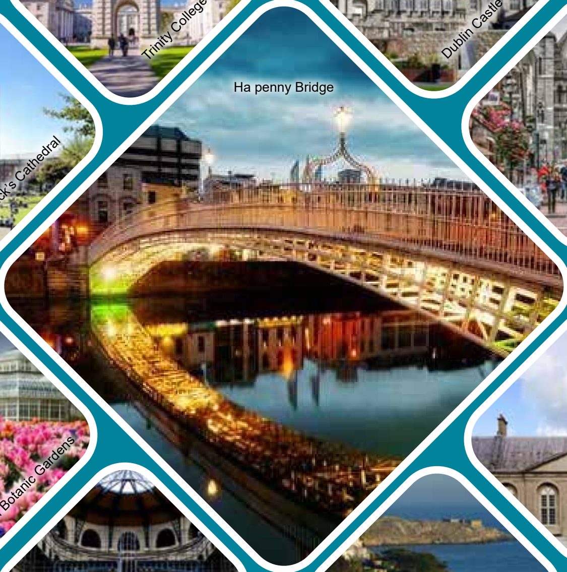
Ha penny Bridge