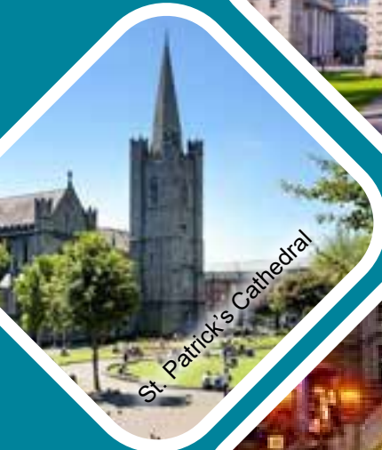
St. Patrick's Cathedral