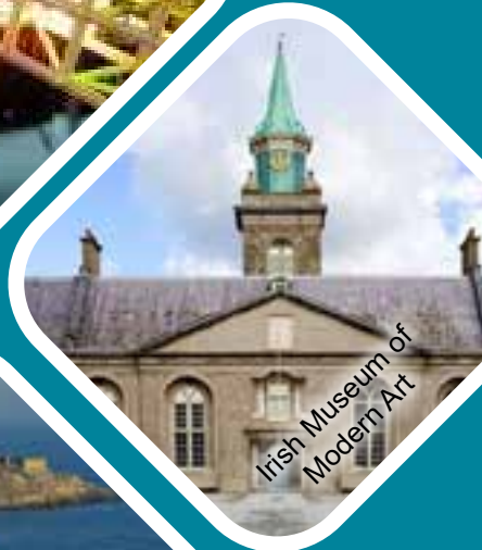
Irish Museum of Modern Art