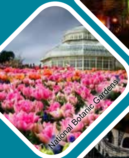
National Botanic Gardens