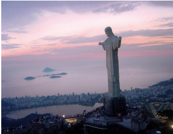
Statue of Christ, Rio de Janeiro