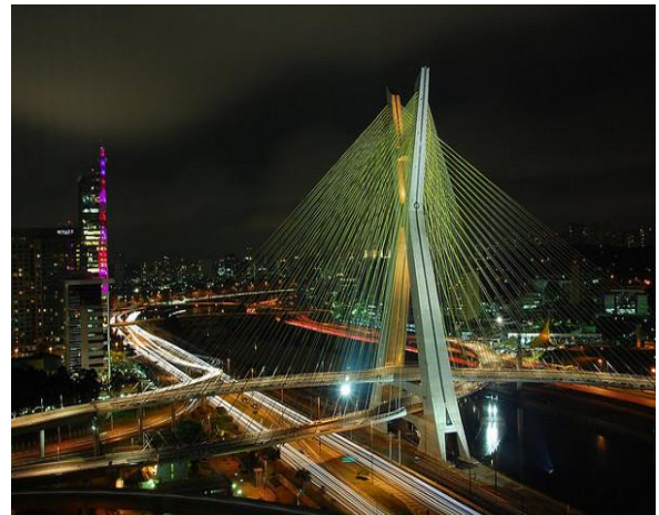
Sao Paulo, Brazil