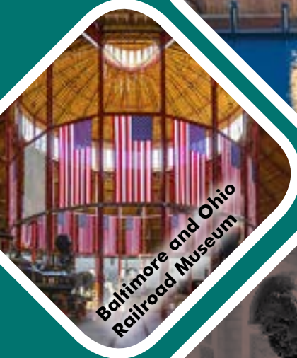
Baltimore and Ohio Railroad Museum