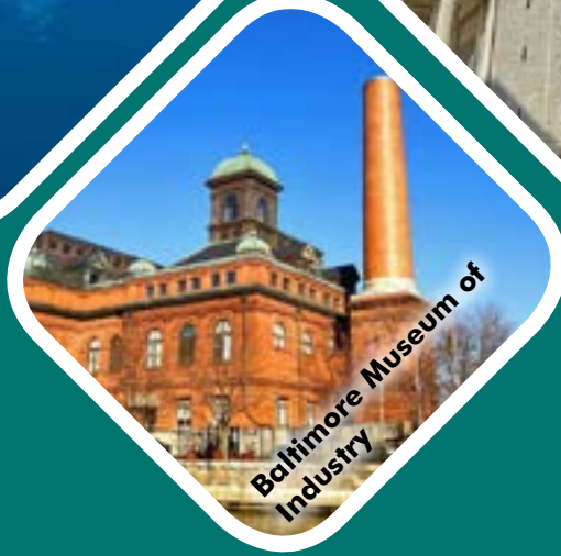
Baltimore Museum of Industry