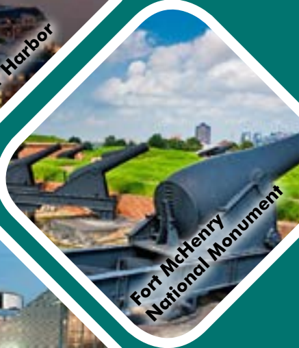
Fort M'Henry National Monument