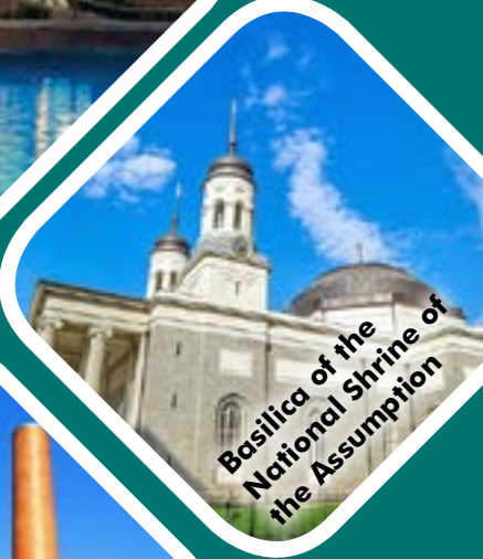
Basilica of the National Shrine of the Assumption