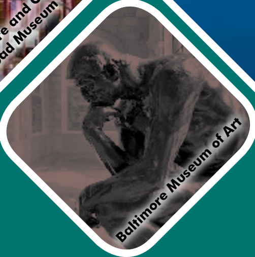
Baltimore Museum of Art