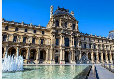
Musée du Louvre