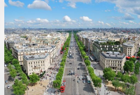
Avenue des Champs-Élysées