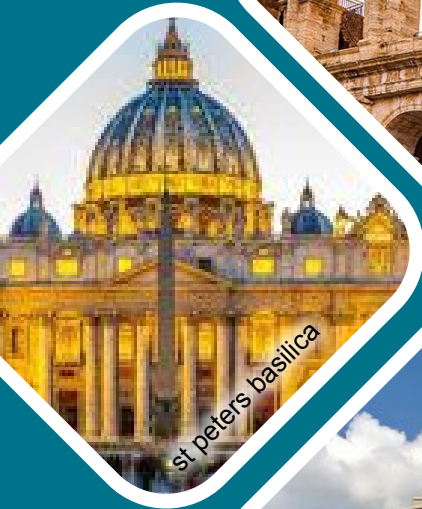
st peters basilica