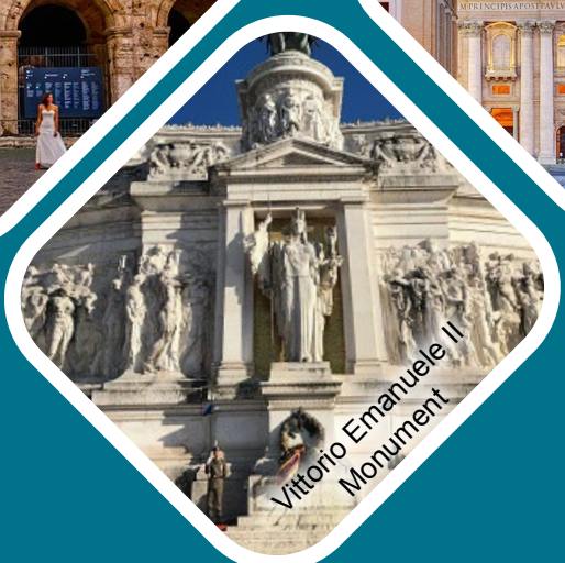
Vittorio Emanuele II Monument