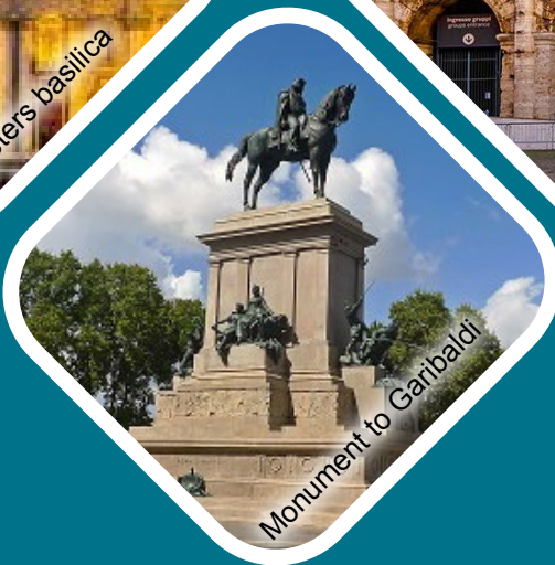
Monument to Garibaldi