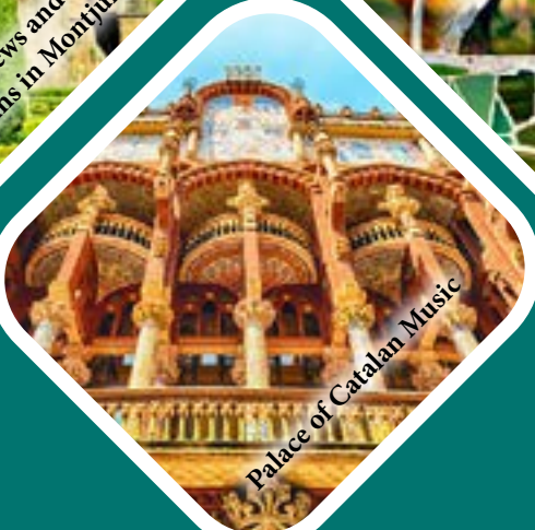
Palace of Catalan Music