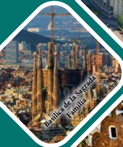
Basilica de la Sagrada Família