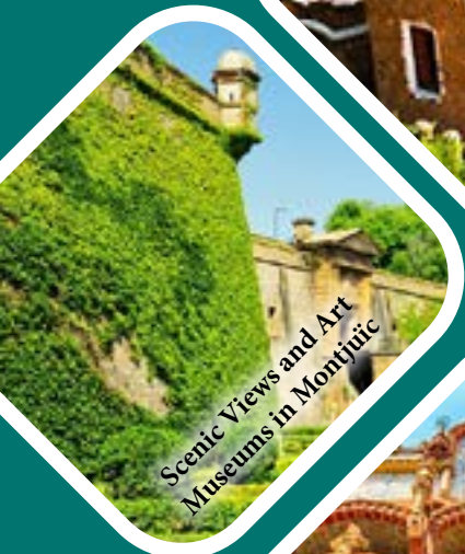
Scenic Views and Art Museums in Montjuïc