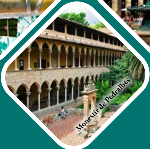
Monestir de Pedralbes