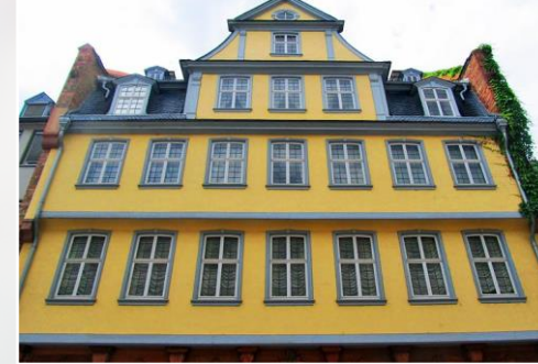
Goethe House and Museum