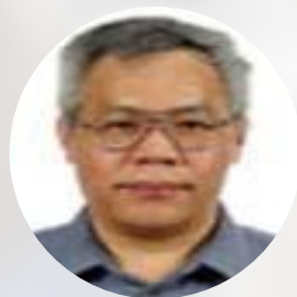
Wang Kai Institute for Systems Biology, Seattle, USA