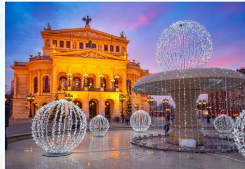
The Old Opera House