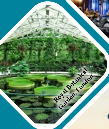
Royal Botanical Garden, London