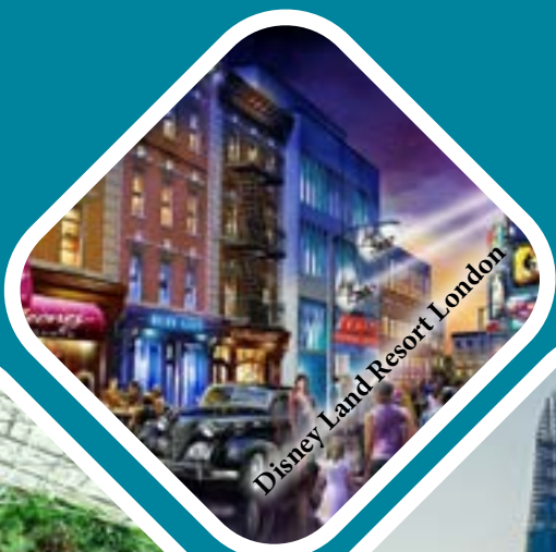
Disney Land Resort London