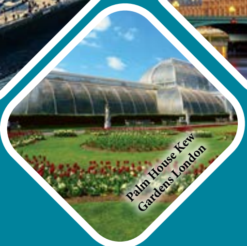
Palm House Kew Gardens London