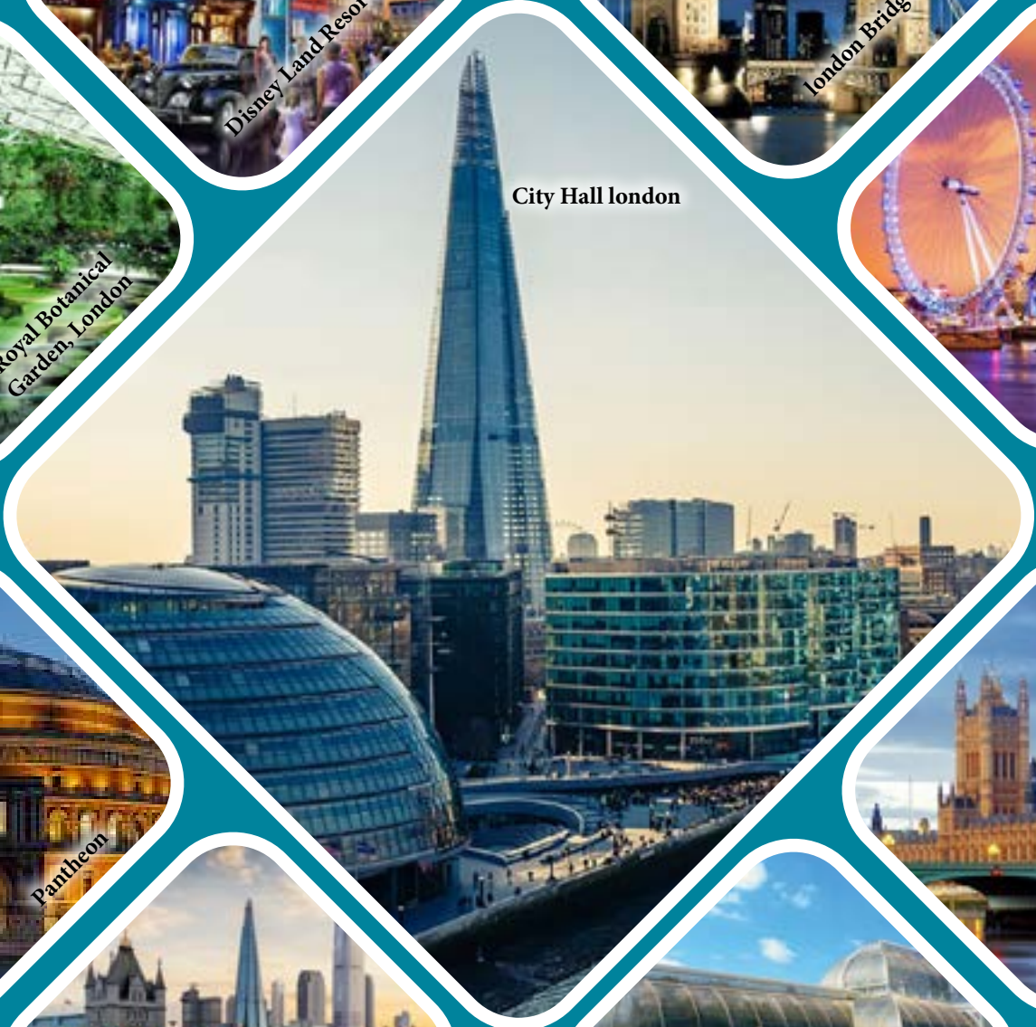
City Hall London