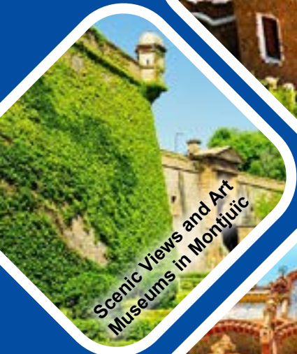
Scenic Views and Art Museums in Montjuïc