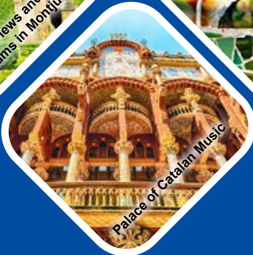
Palace of Catalan Music