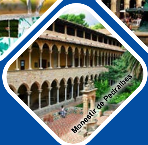
Monestir de Pedralbes