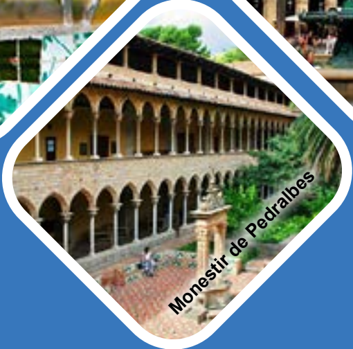
Monestir de Pedralbes