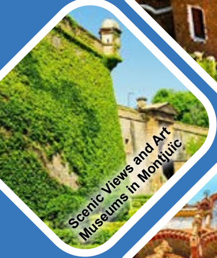
Scenic Views and Art Museums in Montjuïc