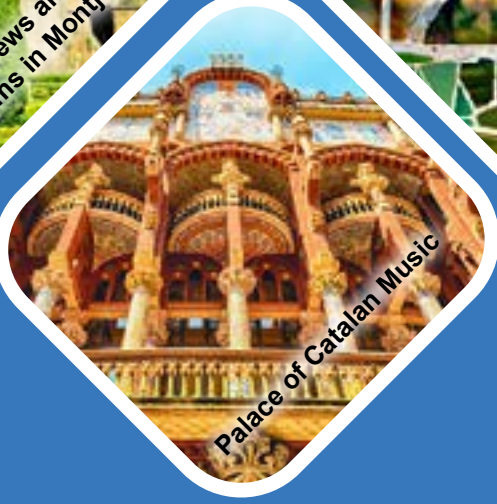
Palace of Catalan Music