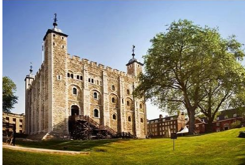
The Tower of London and Tower Bridge