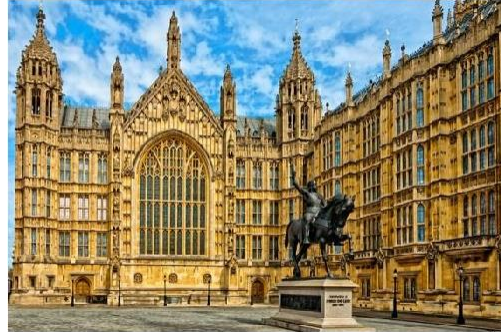
Big Ben and Parliament