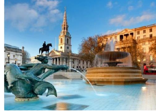
Piccadilly Circus and Trafalgar Square