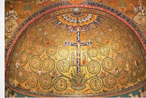
Church of San Clemente