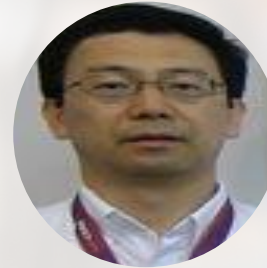
Jun Soma Iwate Prefectural Central Hospital, Japan