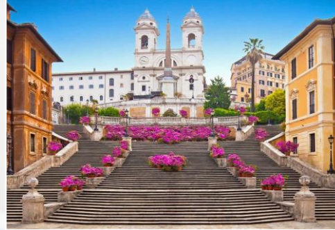
Centro Storico & the Spanish Steps