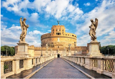
Castel Sant'Angelo National Museum