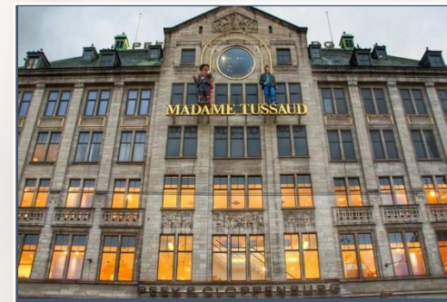
Madame Tussauds London