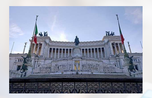
Vittorio Emanuele II Monument.