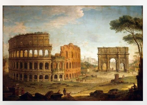
The Colosseum and the Arch of Constantine