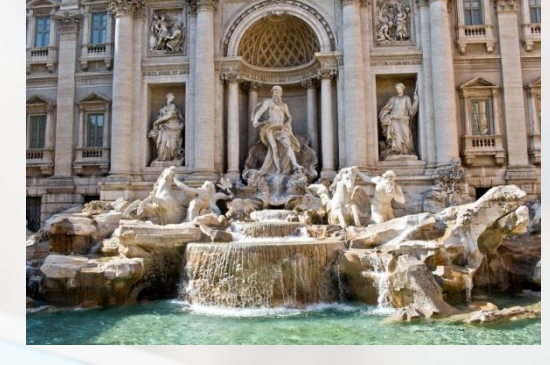
Trevi Fountain. Trevi Fountain