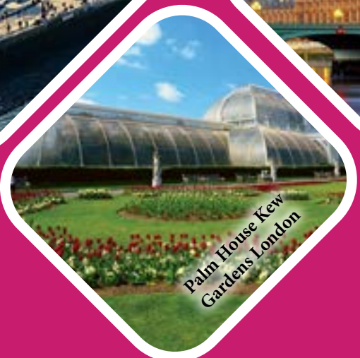
Palm House Kew Gardens London