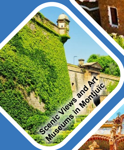
Scenic Views and Art Museums in Montjuïc