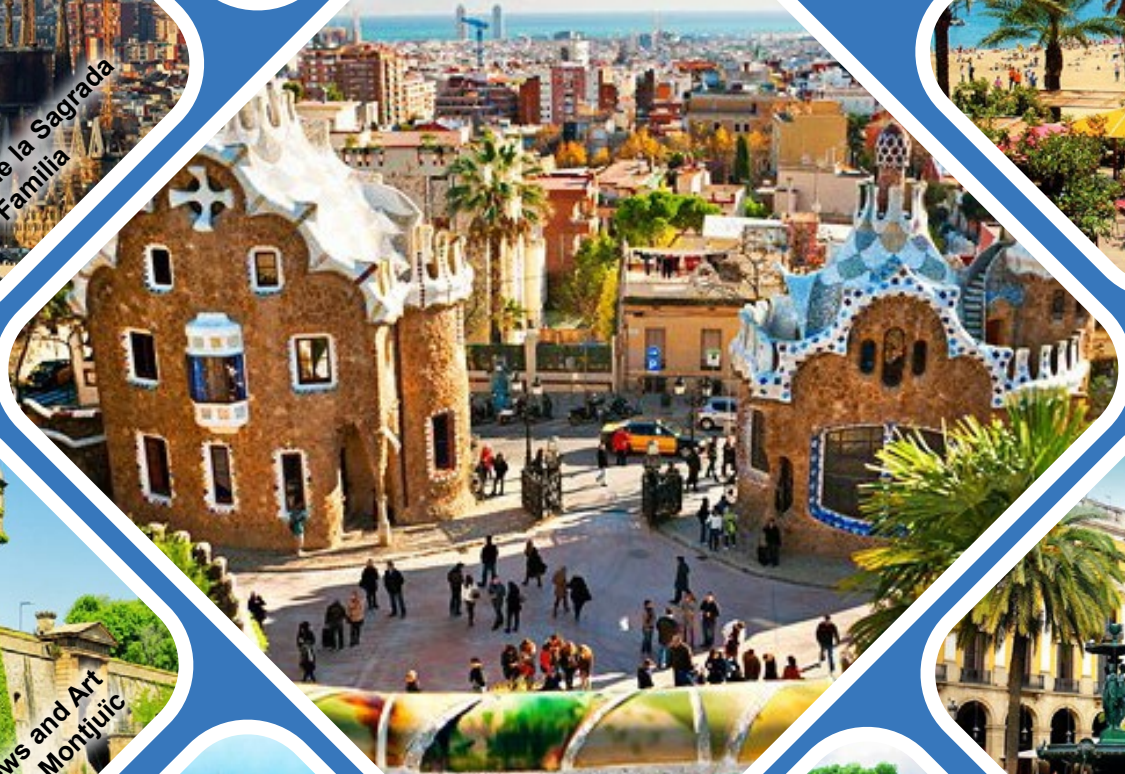
Gaudí's Surrealist Park