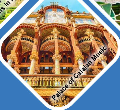
Palace of Catalan Music