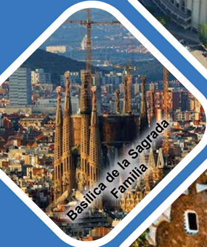
Basilica de la Sagrada Família