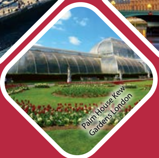
Palm House Kew Gardens London