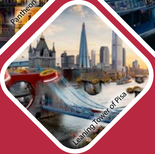
Leaning Tower of Pisa