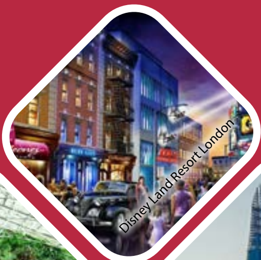
Disney Land Resort London