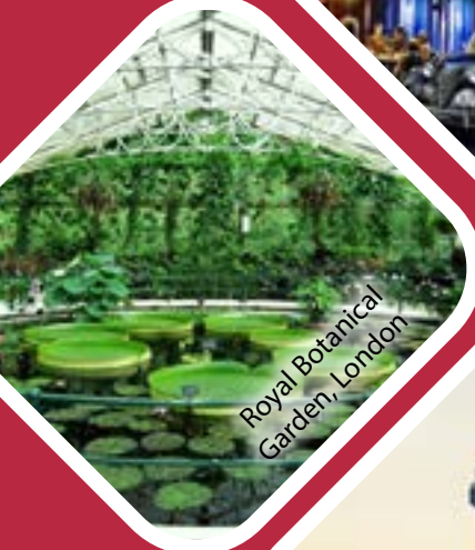
Royal Botanical Garden, London