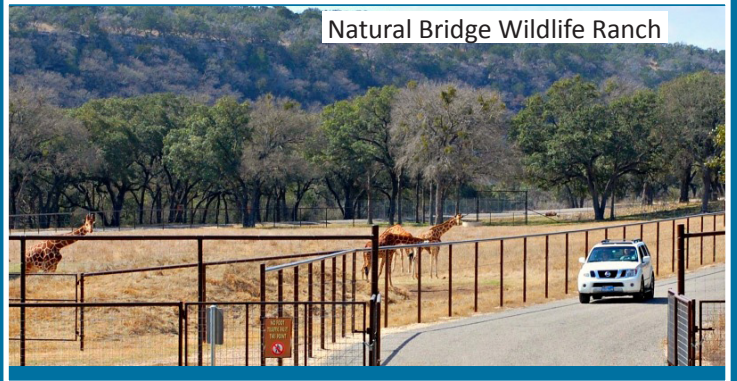
Natural Bridge Wildlife Ranch