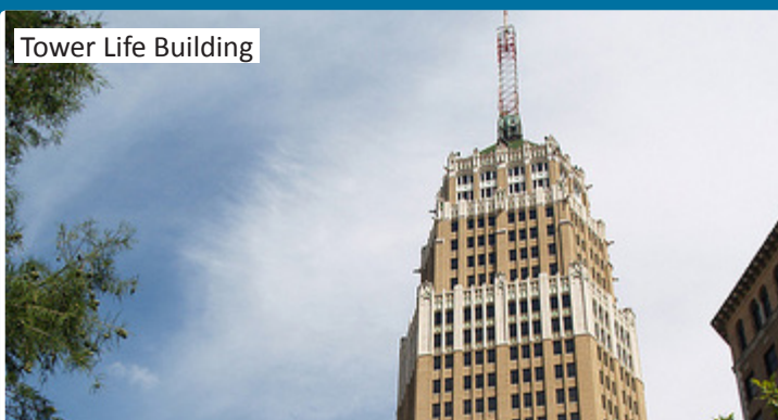
Tower Life Building