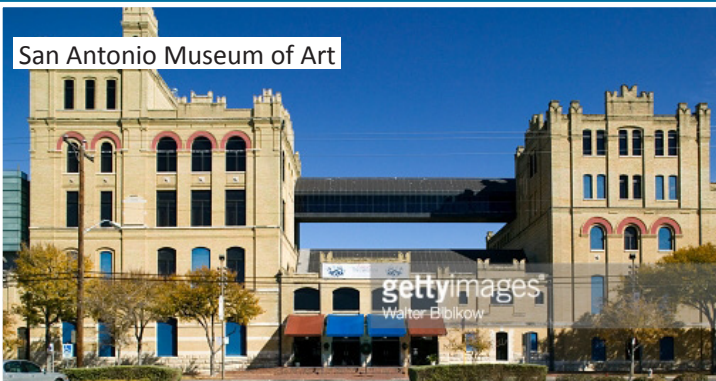
San Antonio Museum of Art