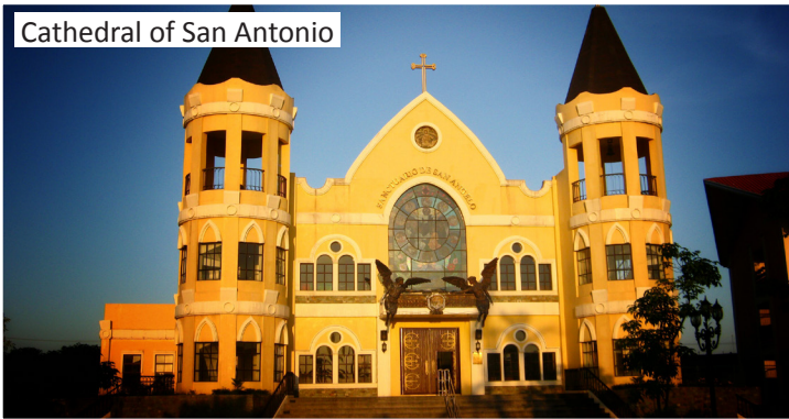
Cathedral of San Antonio