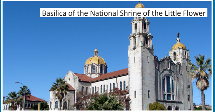
Basilica of the National Shrine of the Little Flower