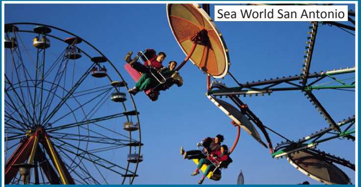
Sea World San Antonio