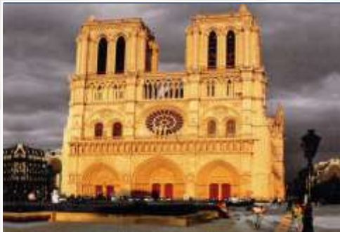
Notre Dame de Paris