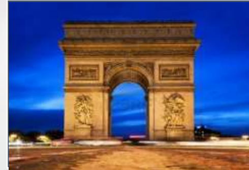
Arc de Triomphe.