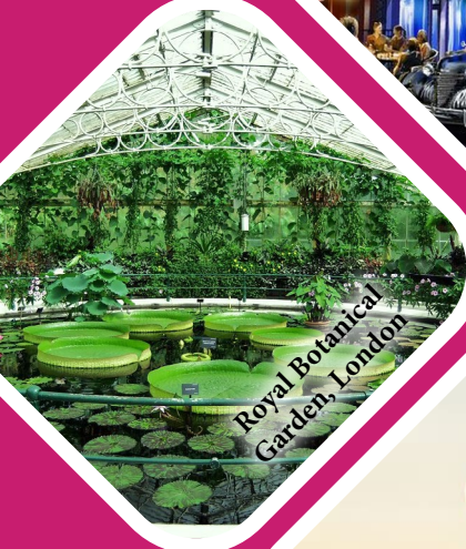
Royal Botanical Garden, London