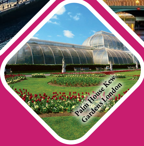
Palm House Kew Gardens London