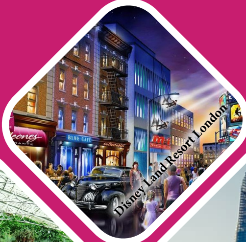
Disney Land Resort London