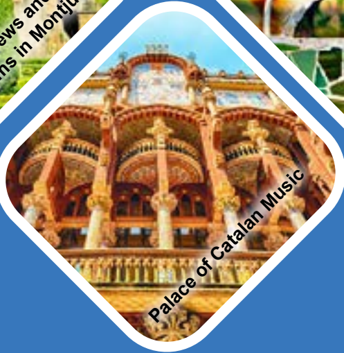
Palace of Catalan Music