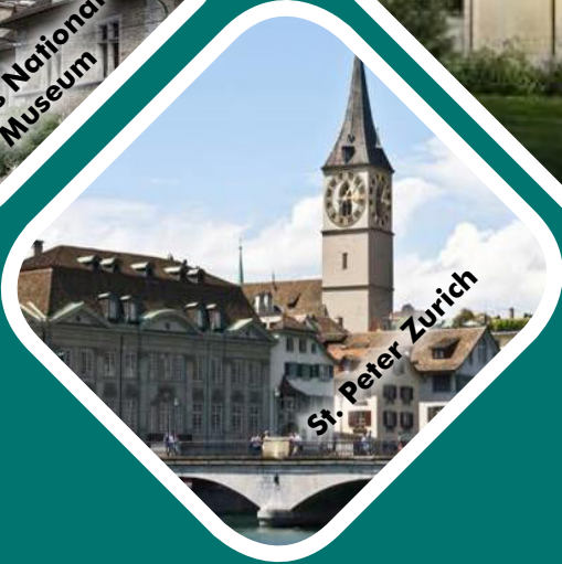
St. Peter Zurich