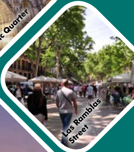
Las Ramblas Street