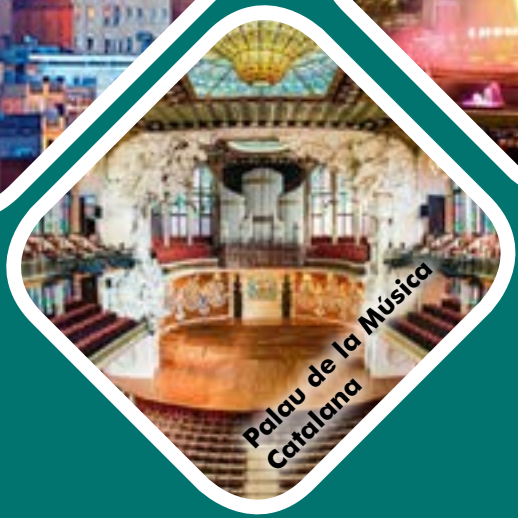
Palau de la Música Catalana