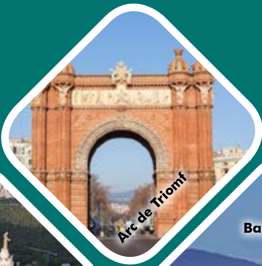
Arc de Triomf