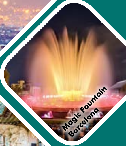
Magic Fountain Barcelona