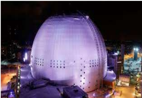
Name of Attraction