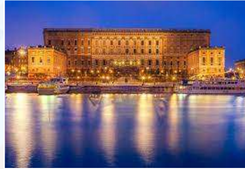
The Royal Palace