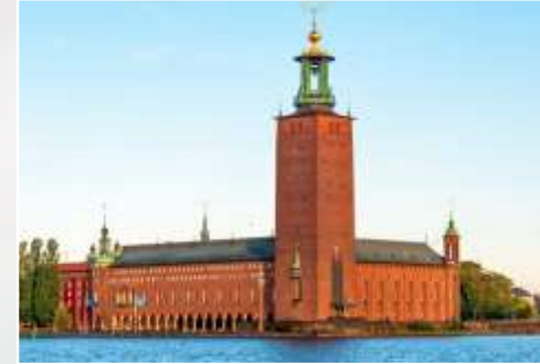
Stockholm City Hall