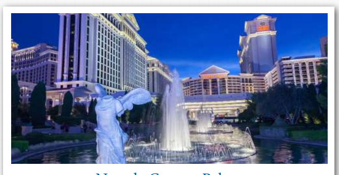
Nevada Caesars Palace