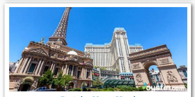
Paris las Vegas Hotel