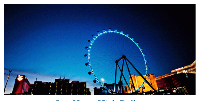
Las-Vegas High Roller