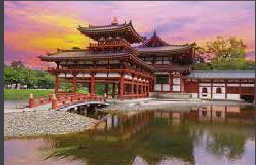
Site: Osaka, Japan

Osaka has developed as the gateway to Japan, serving as a center for international trade and cultural interaction. It had its own port by the 5th century and by the 17 th century; the city had become a center of distribution for the rest of Japan, with many specialty products from the provinces finding their way to Osaka. The canals and bridges that were built by the people to facilitate the movement of goods helped to shape the city and their influence can still be seen to this day. Riverside attractions include the tree-lined banks of the gently flowing rivers in the Okawa~Nakanoshima area, the lively Dotombori area and the Bay area with its new amusements and theme parks.