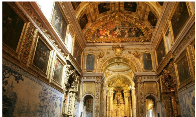
National Azulejo Museum