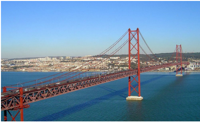
25 de Abril Bridge