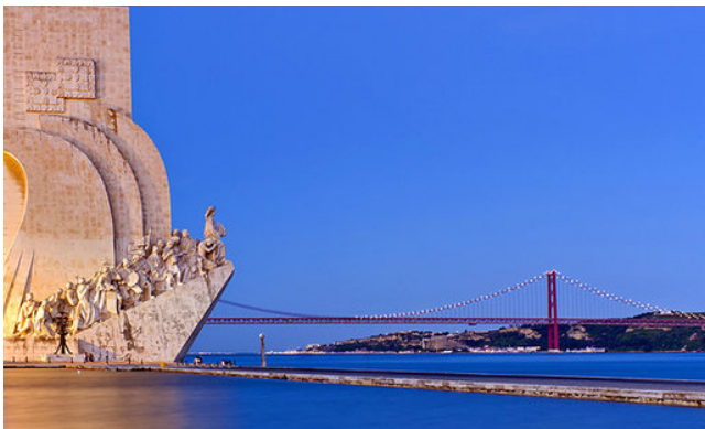
Monument To The Discoveries