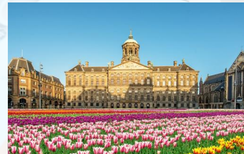
Amsterdam Royal Palace