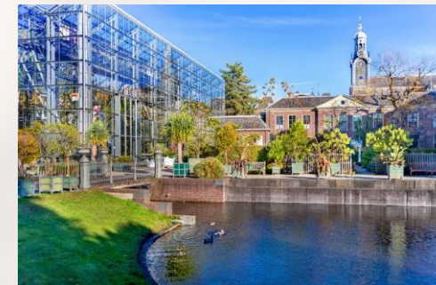
The Botanical Gardens