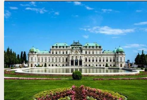
The Belvedere Palace