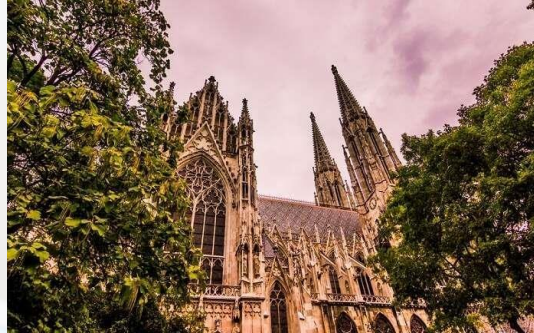
St. Stephen's Cathedral