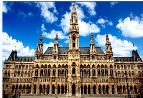
Vienna City Hall