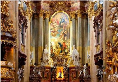
St. Peter's Church