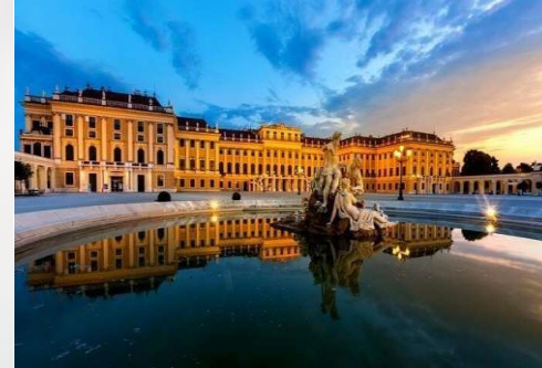
Schönbrunn Palace and Gardens