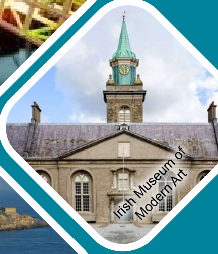
Irish Museum of Modern Art