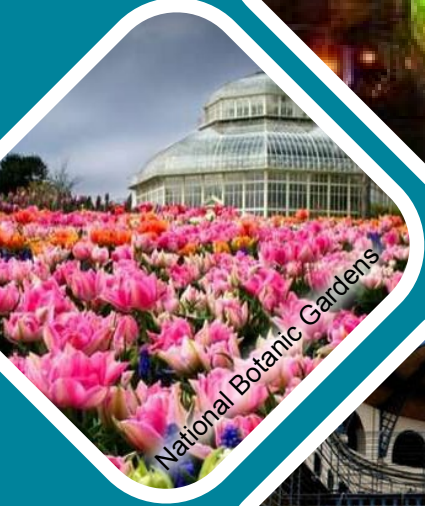
National Botanic Gardens