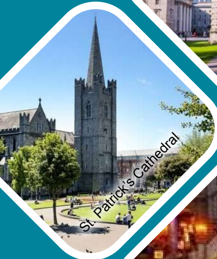
St. Patrick's Cathedral