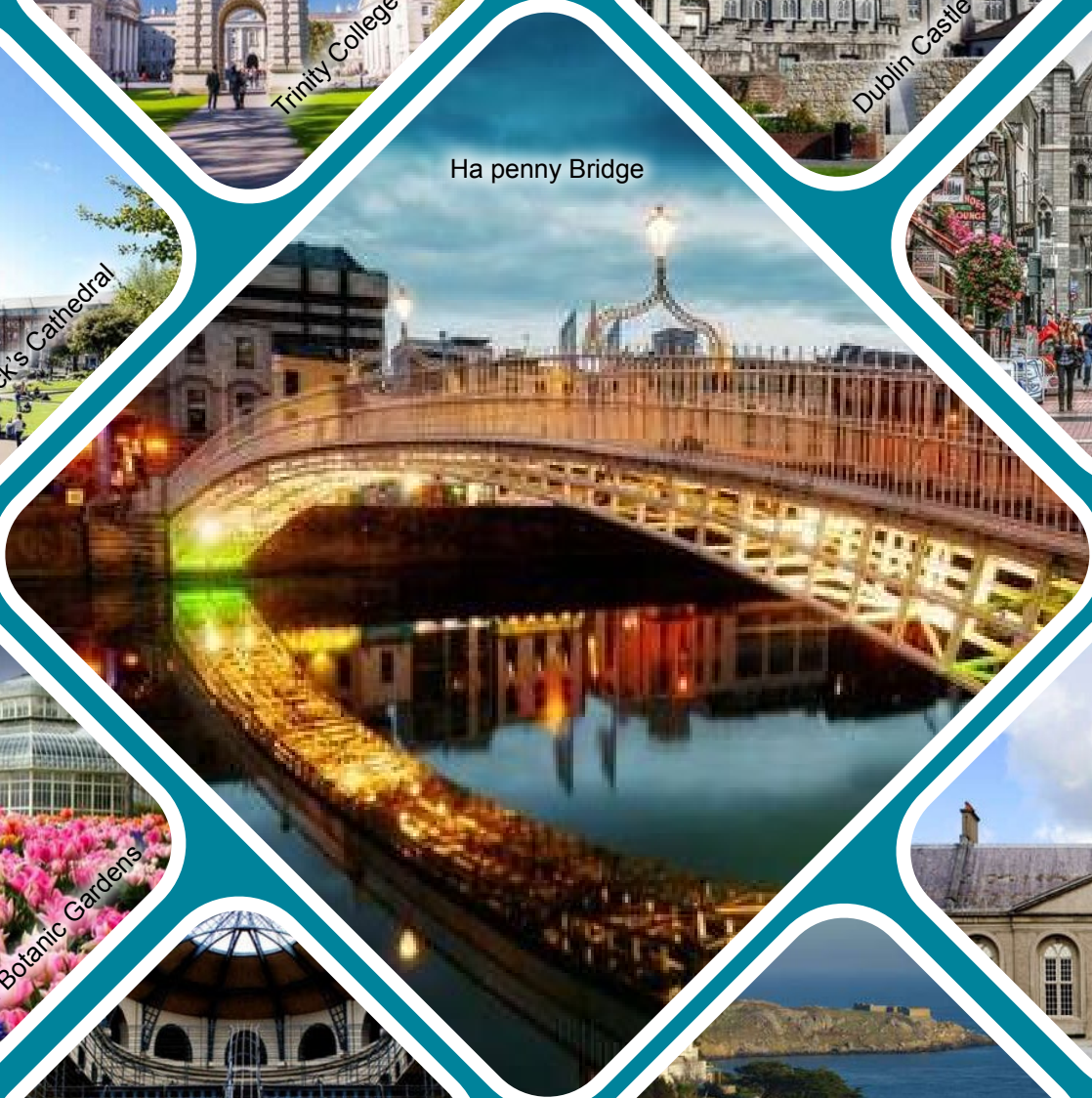
Ha penny Bridge