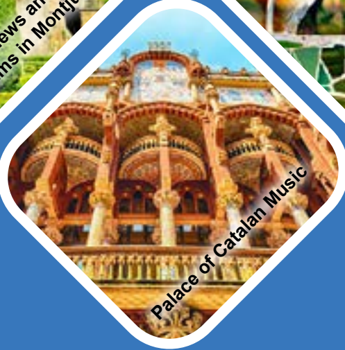
Palace of Catalan Music