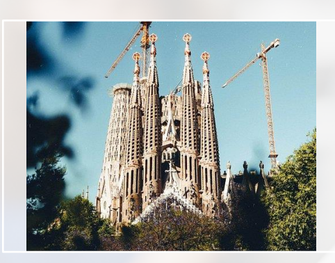
Basílica de la Sagrada Familia