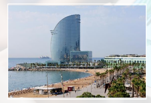
W Barcelona (Hotel Vela