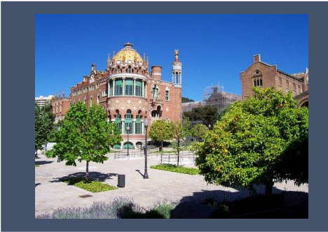
Recinte Modernista de Sant Pau