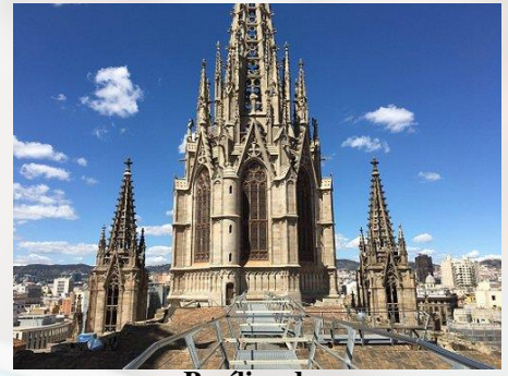
Basílica de Santa Maria del Mar