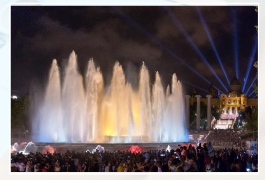
Magic Fountain of Montjuïc