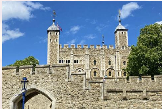
The Tower of London