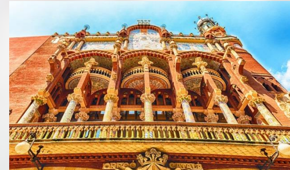
Palau de la Música Catalana (Palace of Catalan Music)