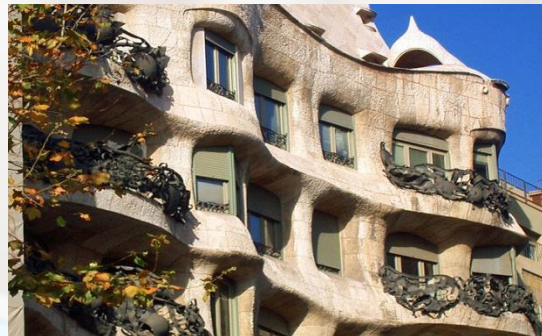
Casa Milà (La Pedrera)