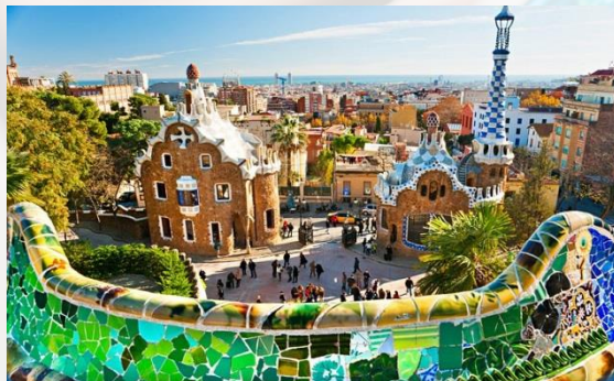
Parc Güell: Gaudí's Surrealist Park