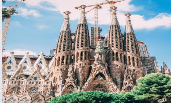
Basílica de la Sagrada Família