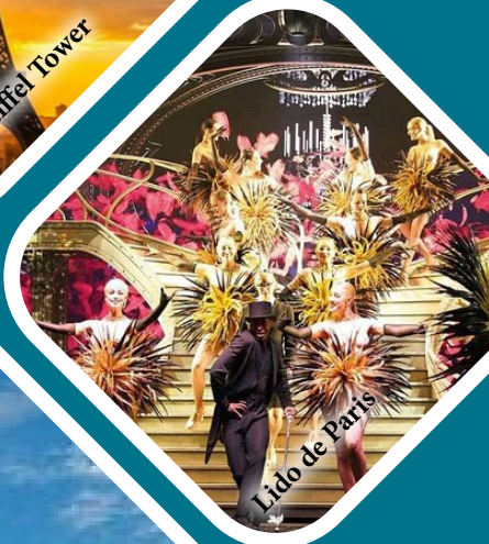
Lido de Paris