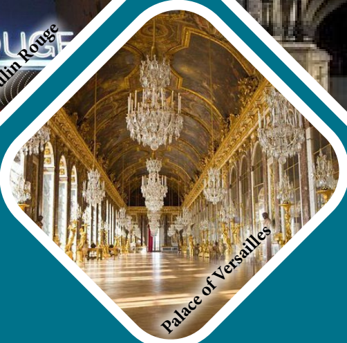
Palace of Versailles