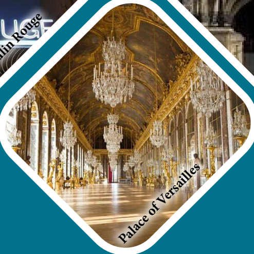
Palace of Versailles