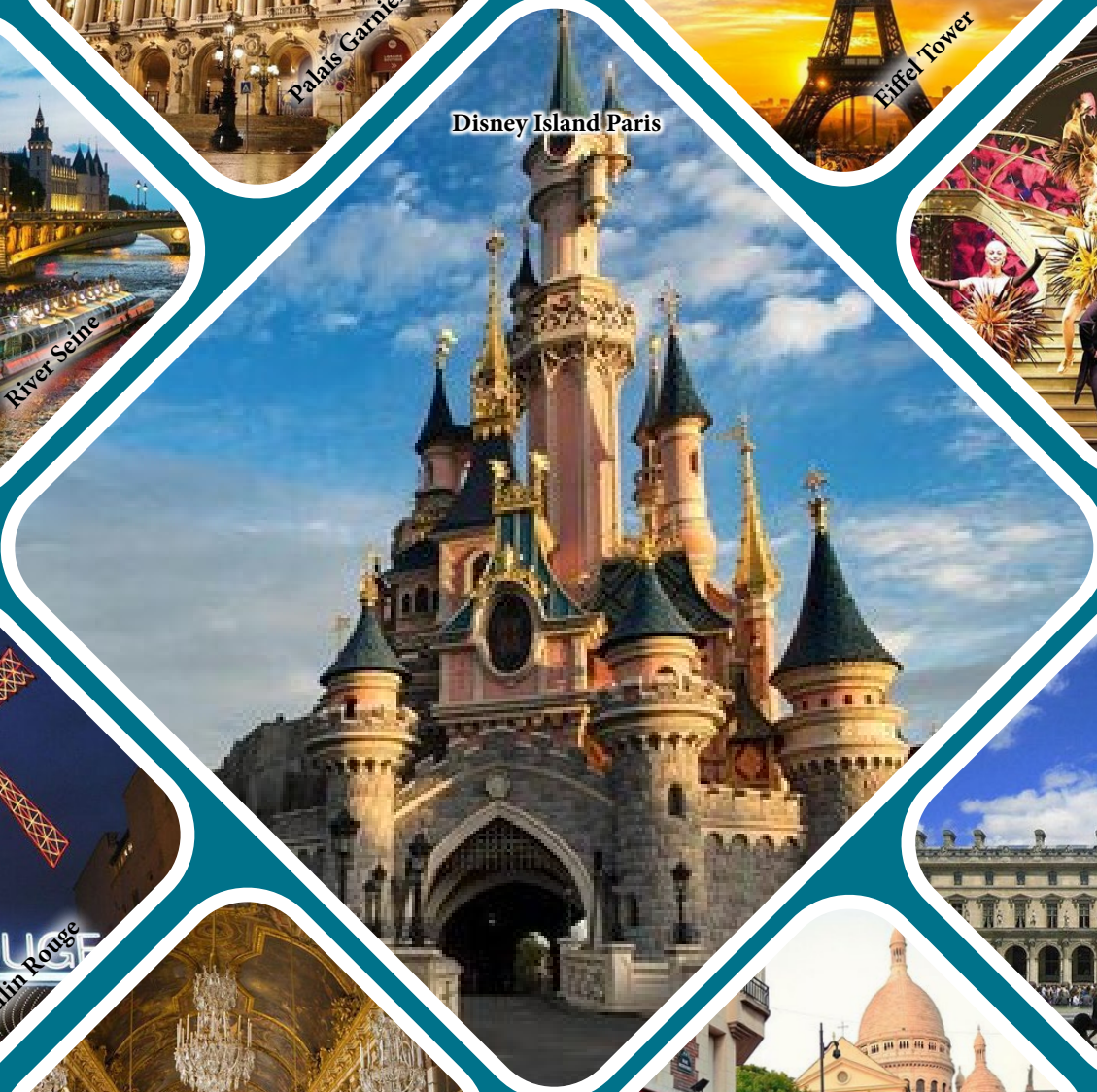
Disney Island Paris