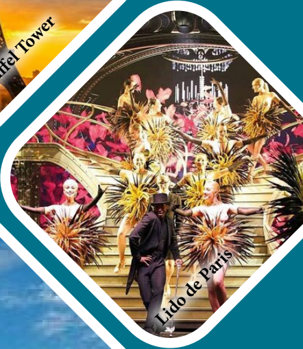
Lido de Paris