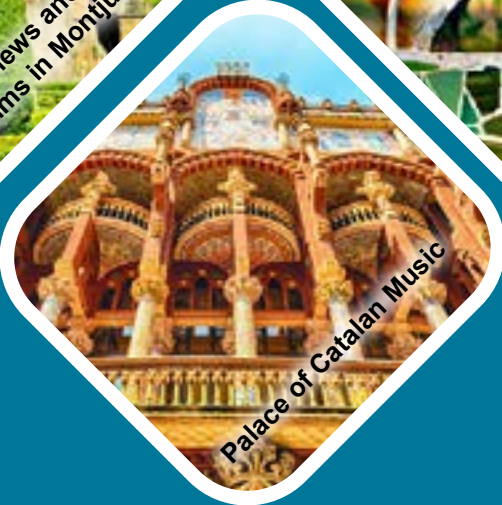
Palace of Catalan Music