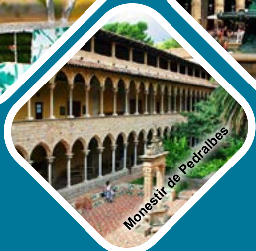
Monestir de Pedralbes