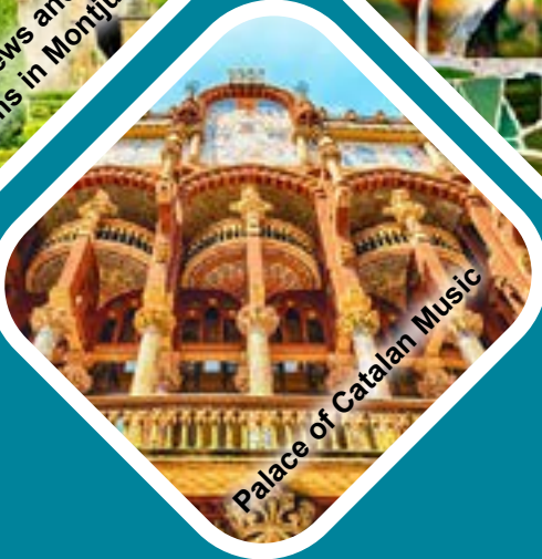
Palace of Catalan Music