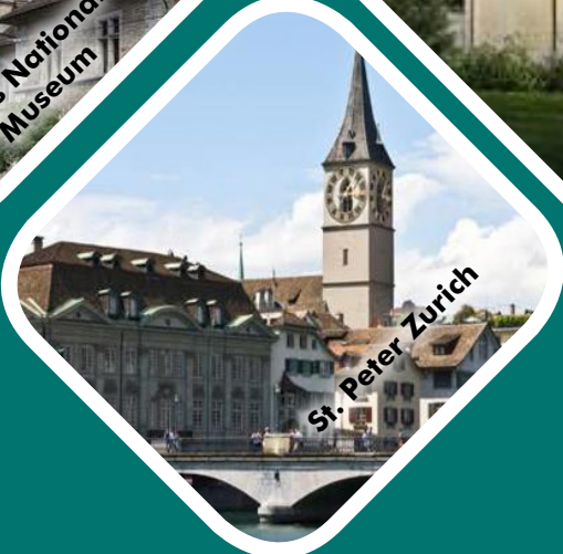
St. Peter Zurich